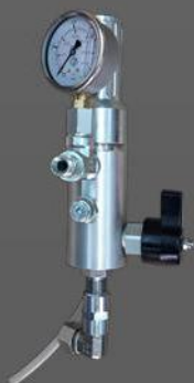
Dura Filter Kit

Equipped with a powerful 4hp motor and an outstanding 10.1 l/min material flow, the DURA-8 High-Flow is ideal for contractors that take on continuous high production coating jobs, with simultaneously users, increasing their businesses profit per square meter.